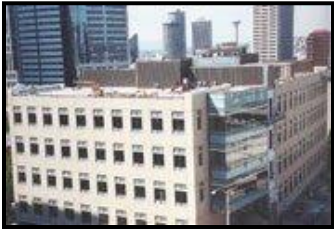
Virginia Mason Hospital